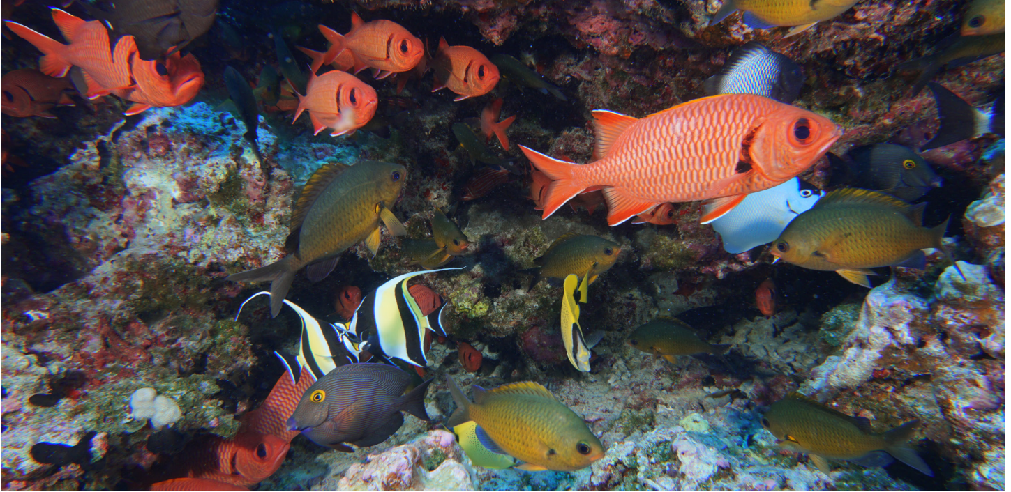
Reef fish in Papāhānaumokuākea Marine National Monument

with the remote ocean wilderness of Papahānaumokuākea Marine National Monument. Project will create exhibits, host public outreach events and use social media to highlight the ecological and cultural resources of the Monument and spotlight the work that is being supported to protect them.