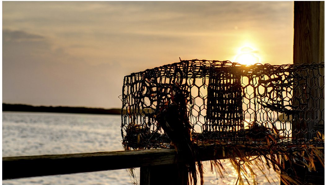
Crab pot in Florida

1133 15th Street, NW Suite 1000 Washington, DC 20005 202-857-0166