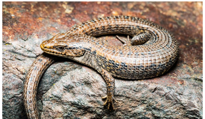
Northern alligator lizard

The Nature Conservancy will protect 3,500 acres of habitat in the Canaan Valley/Dolly Sods region of West Virginia. The protected land will contribute to climate resilience, conserving wetlands and headwater areas and will help expand connections to 75,000 acres of existing conservation areas.