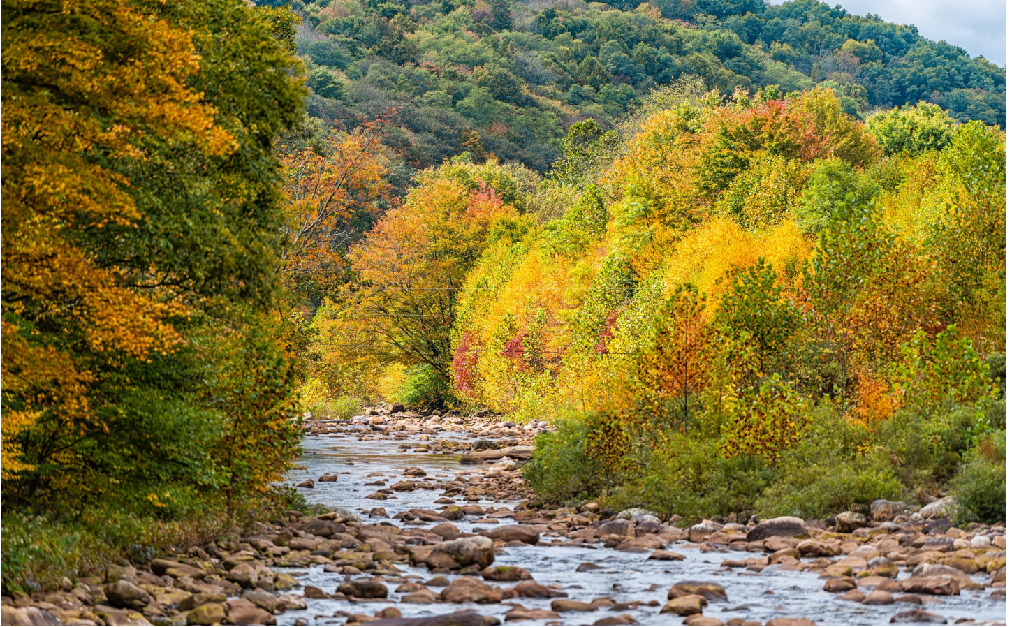
Fall foliage in Canaan Valley