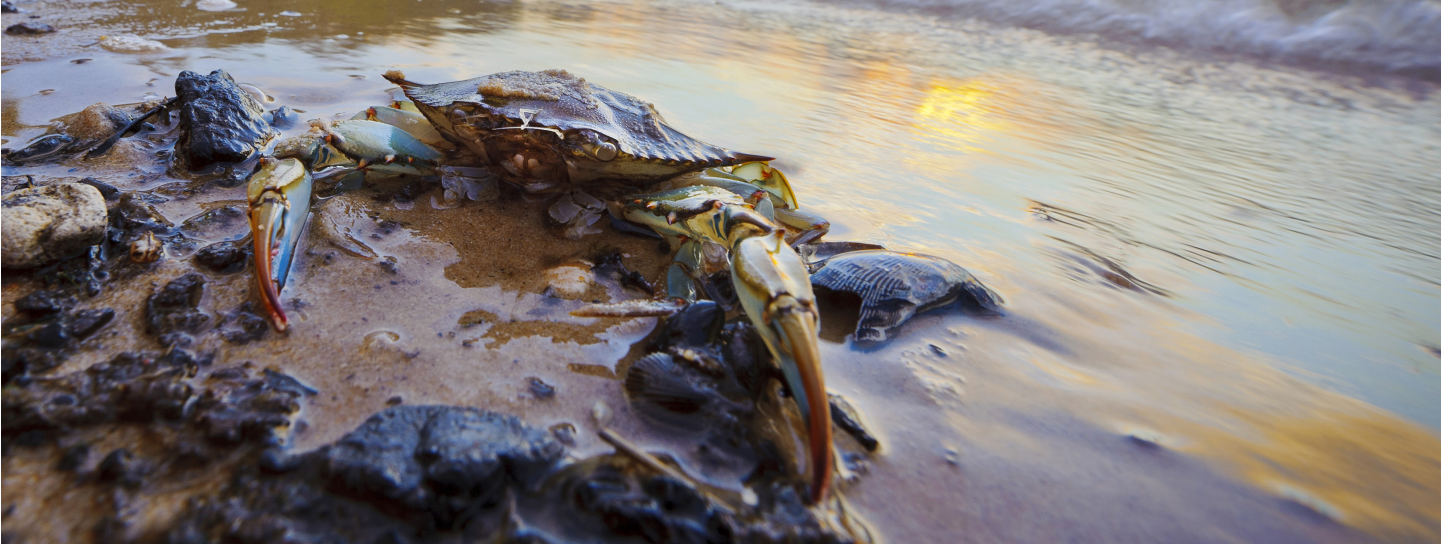
Blue crab on Chesapeake Bay, Maryland