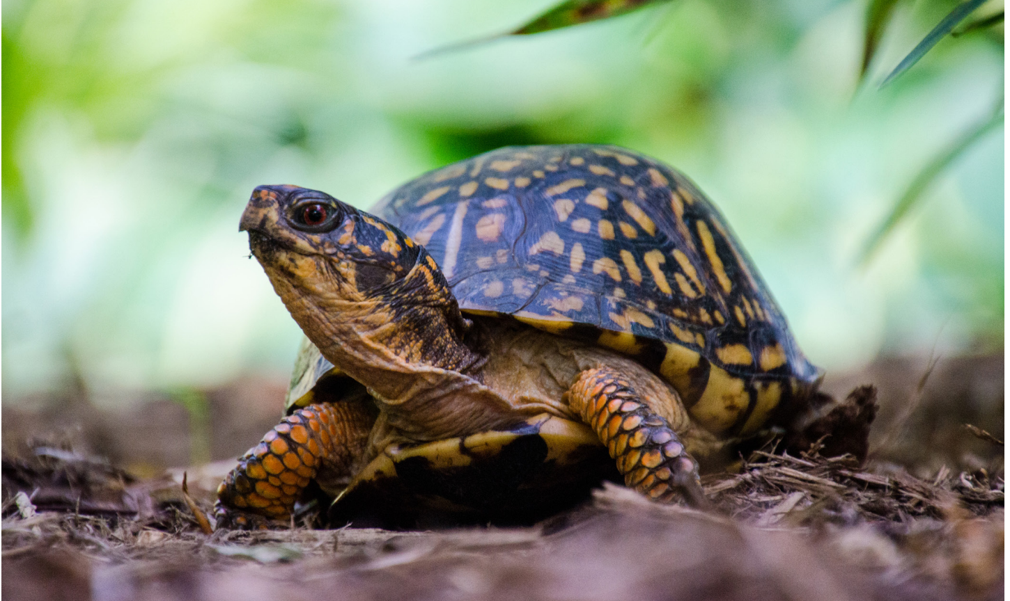
Eastern box turtle