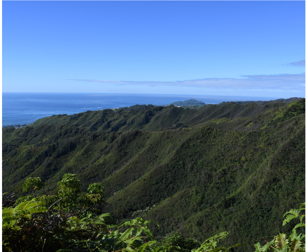
Kuli'ou'ou Forest Reserve, O'ahu

1133 15th Street, NW Suite 1000 Washington, D.C., 20005 202-857-0166