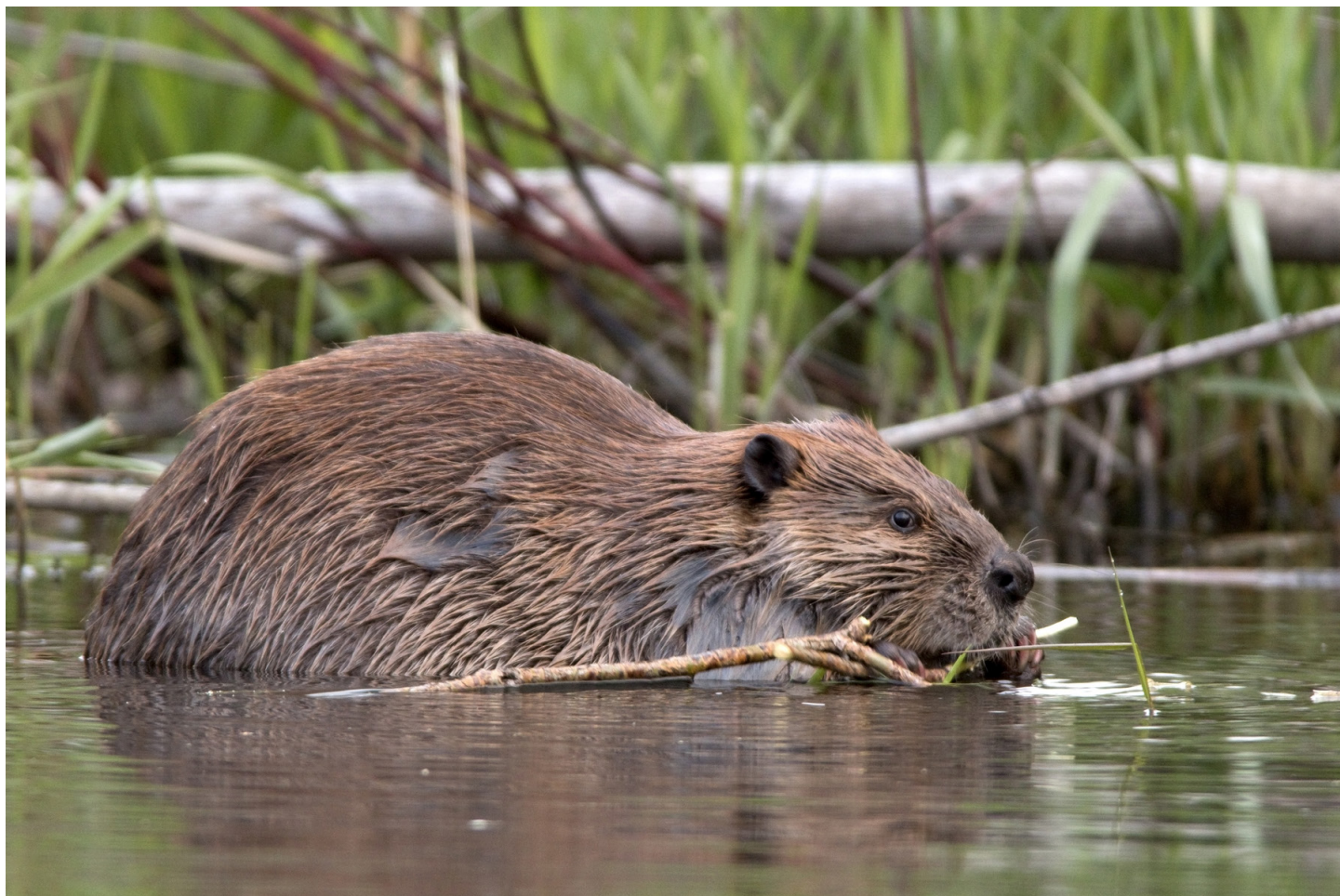
North American beaver

In three years, the Southwest Rivers Headwaters Fund has invested a total of $2.1 million in 15 projects leveraging $2.6 million in matching contributions to generate a total on-the-ground conservation impact of more than $4.7 million. These projects benefit unique southwestern riparian species like Rio Grande cutthroat trout, North American beaver and Chiricahua leopard frog by addressing the leading factors in aquatic and riparian species decline such as loss of natural processes and habitat, environmental change, and invasive species. Maintaining healthy headwater streams can help replenish water upstream and provide security for water users, fish, and wildlife downstream.