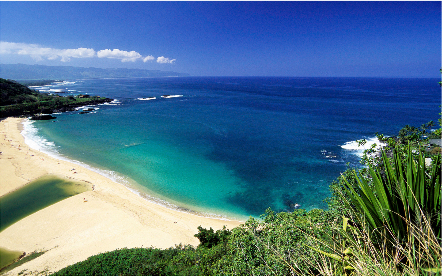
Waimea Bay, Oahu, Hawaii

Since its inception, Acres for America has funded 80 projects in 35 states, the District of Columbia and Puerto Rico to permanently protect more than 1.3 million acres — far surpassing its original goal of 100,000 acres — and connecting over 10 million acres.