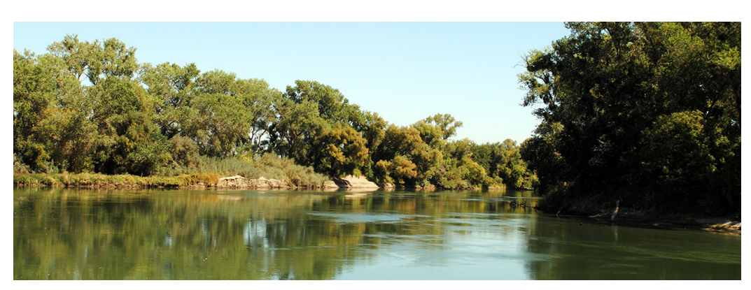
The Sacramento River