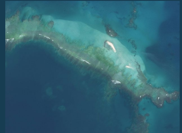
Above: Aerial photo shows before and after Hurricane Walaka of East island