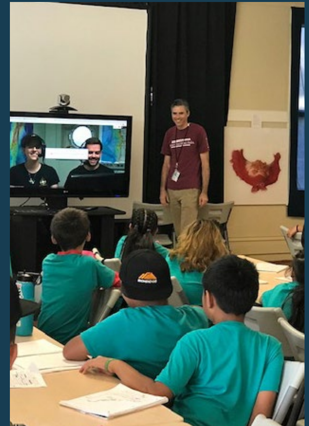
Left: Hawaiian Coral Reefs Above: Sharing from the E/V Nautilus with students