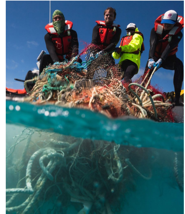
Right: Debris on Lisianski island | PMDP Above: "Manpower" to haul heavy nets | PMDP

In the most recent effort of 2021, the project expanded beyond standard removal efforts to concentrate on hurricane debris at Lalo and make modifications to the existing sea wall. Having a trained team with the right tools, allowed management to reduce harm to nesting and resting animals that were becoming trapped behind an exposed sea wall as a result of eroding beaches.