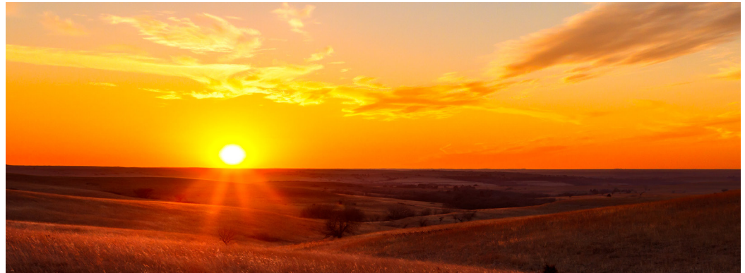
Flint Hills, Kansas

1133 15th Street, NW Suite 1000 Washington, D.C., 20005 202-857-0166