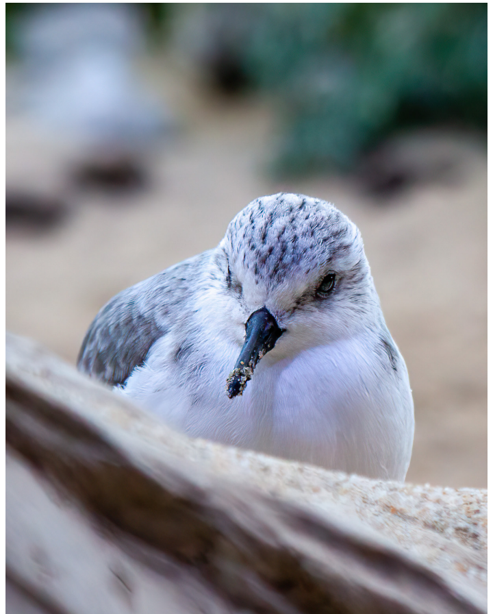
Western snowy plover

Grantee: Smith River Alliance Grant Amount:..... $4,467,200 Matching Funds:..... $742,000 Total Project Amount:..... $5,209,200 Enhance undersized culverts to appropriately sized stream crossings to restore 6.5 miles of fish passage at eight fish passage barriers to support the recovery of salmonids like the coho salmon and improve infrastructure to protect evacuation routes and enhance resilience in a changing climate. Project will engage nine government entities to restore fish passage at eight high priority locations in coastal watersheds of Del Norte County.