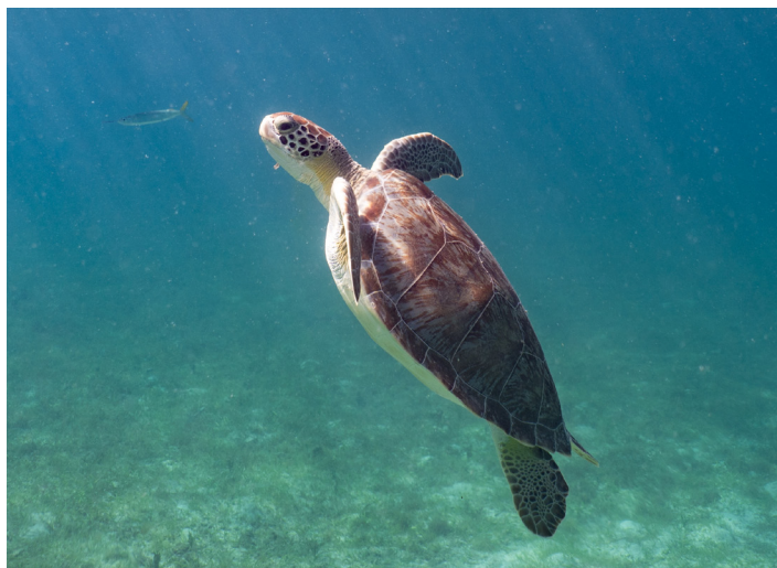
Green sea turtle in the U.S. Virgin Islands

Grantee: Centro para la Reconstrucción del Hábitat Grant Amount:.....$292,200 Matching Funds:.....$0 Total Project Amount:.....$292,200 Enhance the knowledge and skills of community members