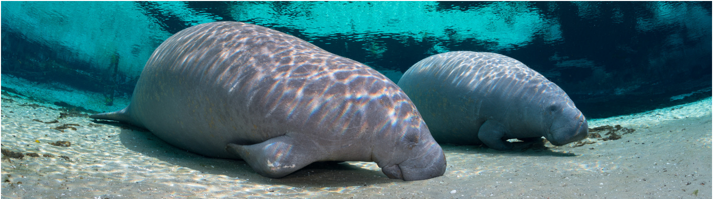
Manatees in Florida