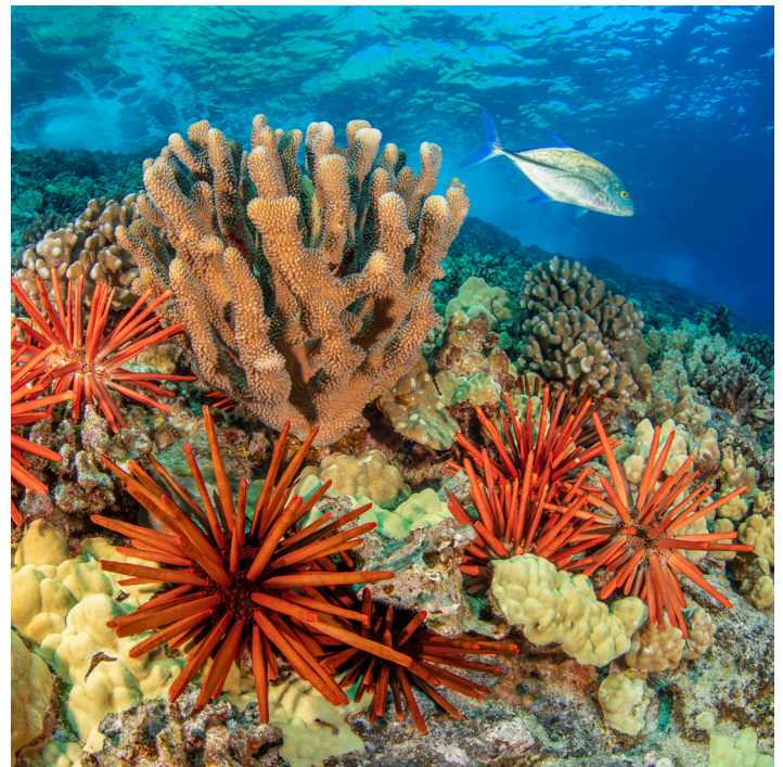
Coral reefs in Hawai'i

Grantee: American Samoa Department of Marine and Wildlife Resources Grant Amount: ..... $250,000 Matching Funds: ..... $0 Total Project Amount: ..... $250,000 Form and train a local watershed assessment team, assess watersheds and coral reefs, establish baselines and develop restoration plans together with the village councils. Project will build capacity to restore two watersheds, enhance survivorship of the threatened coral species Isopora crateriformis , and support subsistence fisheries in economically challenged indigenous Polynesian communities.