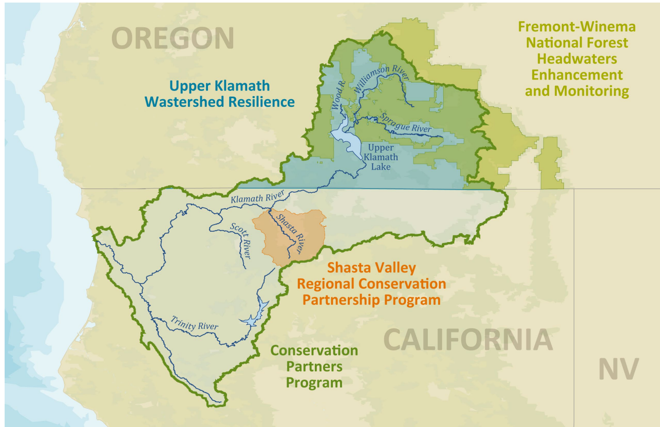
Figure 1. Target geographies for all funding opportunities