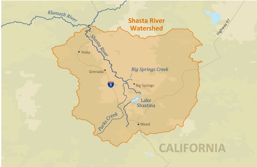
Figure 2. Target geography for the Shasta Valley Regional Conservation Partnership Program

For the Shasta Valley Regional Conservation Partnership Program: Projects must be located within the Shasta River watershed including Big Springs Creek, Parks Creek, or other tributaries.