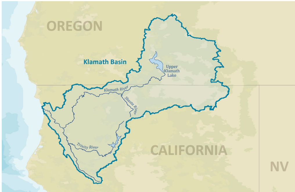
Figure 3. Target geography for the Conservation Partners Program

For the Conservation Partners Program: Projects must be located on private agricultural working lands in the Klamath River Basin.