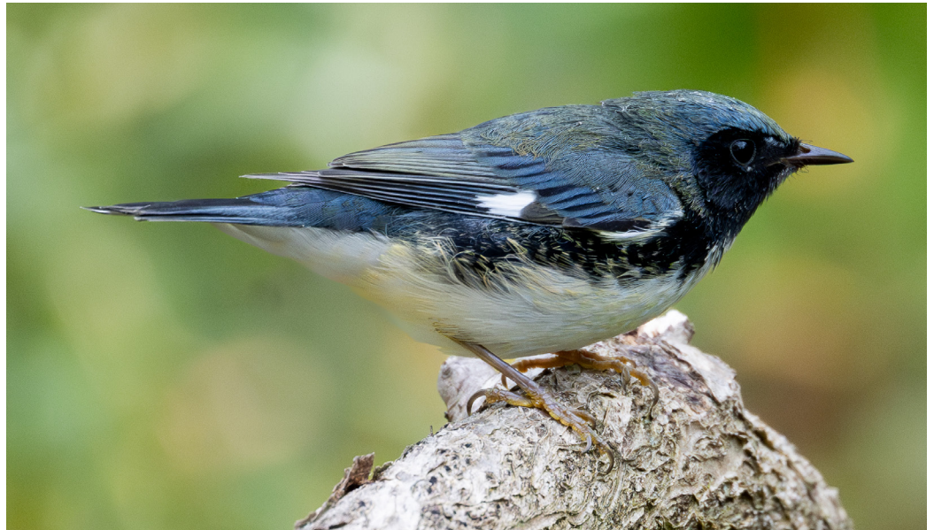
Black-throated blue warbler

1625 Eye Street, NW Suite 300 Washington, D.C., 20006 202-857-0166